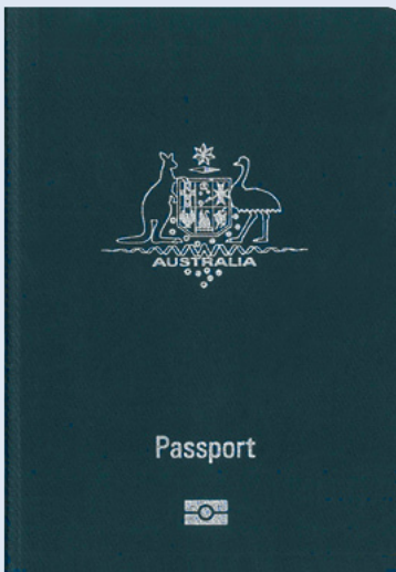
Australian or foreign passport