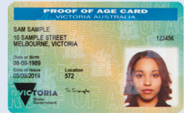
Proof of age card