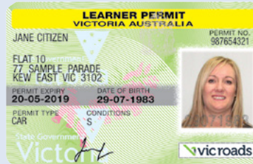
Victorian learner permit