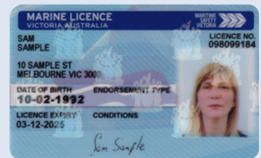
Victorian marine licence