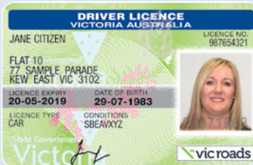
Australian driver licence